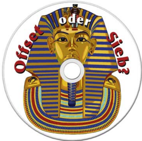
Offset with white

Due to the metallic surface of the CD/DVD the effect of the colours deviates to the colours on a white background (e.g. paper). Should the appearance of the CD/DVD comply with a proof or a PDF illustration we recommend in either case a white pre-print.