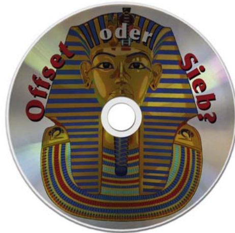
Offset without white