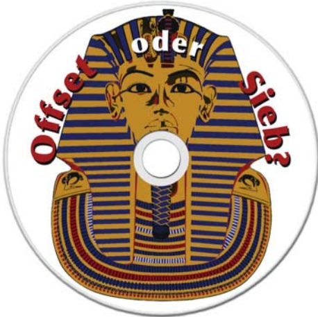
Silk screen with Pantone colours on white

The silk screen print is predestined for the colour fast depiction of text, lines and surfaces. Due to the thickly applied coating, the colours appear more intensive, stronger and with more brilliance than a depiction in CMYK offset.