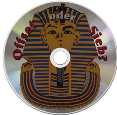
Silk screen with Pantone colours without white

Grid depictions in silk screen print are, of course, also possible. However, process related there is a lower resolution (max. 48 Lines/cm), the tonal shift as described below in vignettted half tone and the danger of a moiré formation in the grid. The moiré, a clearly visible and disturbing, coarse structure pattern, occurs in silk screen due to the interference of the film raster with the screen texture and cannot be 100% avoided.