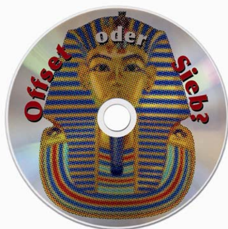
Silk screen print CMYK without white

The offset print is particularly suitable for the depiction of photo realistic motifs, as it is reproduced with a noticeably higher resolution (max. 80 lines/cm). The finest details can be transmitted; vignettted half tones are evenly and cleanly portrayed.